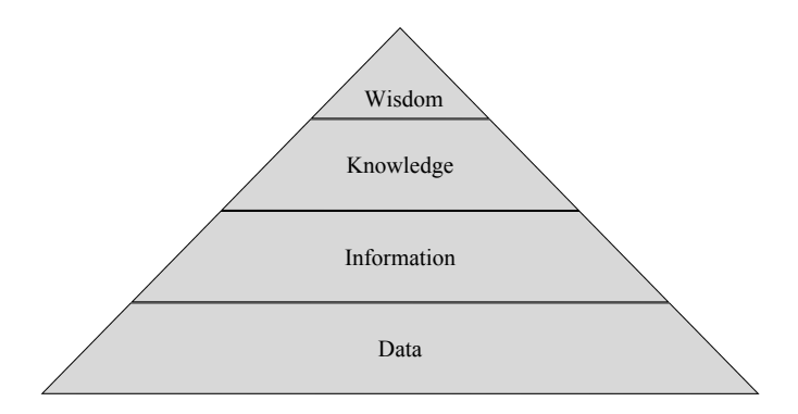
Fig. 1. Relationships between notions

The distinction between data, information, knowledge and wisdom is shown in Figure 1.