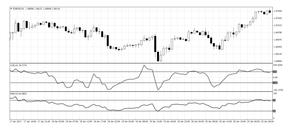
Figure 1. Example indicators and the price chart

To be more specific, we use two very popular technical indicators: the Relative Strength Index (RSI) and the Commodity Channel Index (CCI). The CCI indicator was originally proposed in the 1980s by Donald Lambert. The rules explaining the indicator are described in (www 1). A description of the RSI indicator can be found in Wilder (1978). These indicators are based on the so-called oversold and overbought levels and are frequently used to predict potential price changes. An example price chart with these indicators is shown in Figure 1. The overbought and oversold levels are in the upper and lower parts of the indicator windows. We have used the default parameters for the indicators with the overbought levels equal to 100 (for CCI), and 70 (for RSI). The oversold levels are equal to -100 and 30. In this particular example, the trading rule can be considered as the situation in which the indicator (CCI or RSI) crosses one of the levels defined above. If it crosses the oversold level upwards, the buy signal is generated. The sell signal is generated in the opposite case, when the overbought level is crossed downwards.